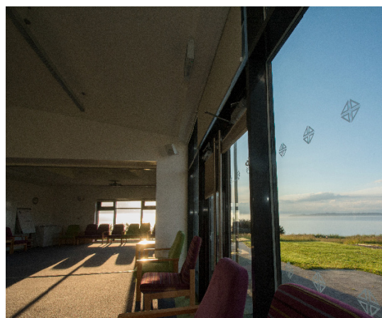
Kenbane Lounge, Davey Village