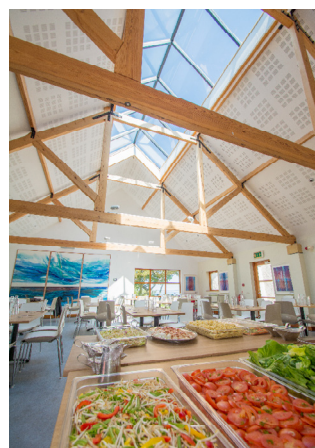
Dining Room, Main House

If you are coming to stay at Corrymeela you will be welcomed into one of our two residential buildings; the Main House and the Davey Village. Both have lounges, meeting spaces and dining facilities, a selection of which can be seen below. Please find more photos of our buildings, spaces and facilities in the Galleries section of our website. While you will be hosted by Corrymeela staff and volunteers, during your stay you are warmly invited to consider this space your home and make it so, whether that be helping yourself to a cup of tea or giving a hand with the dishes.