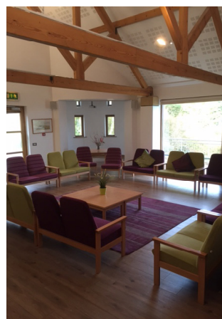
Lounge, Main House