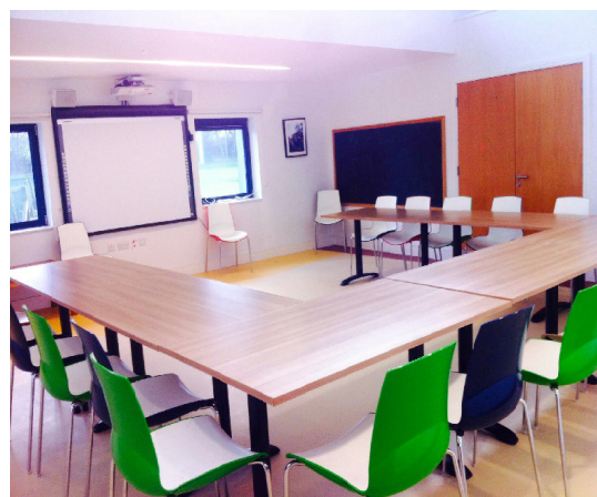
Fitzpatrick Room, Davey Village