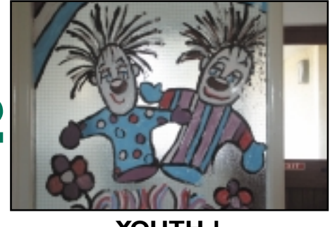
YOUTH I Activities of young people at Corrymeela