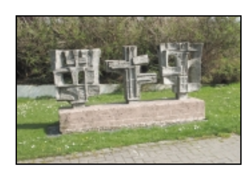
CORRYMEELA VIEWS Various Images